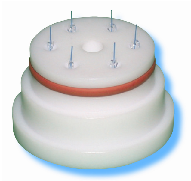
Reusable Flexible Iris Retractors