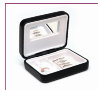
Patient Treatment Kit