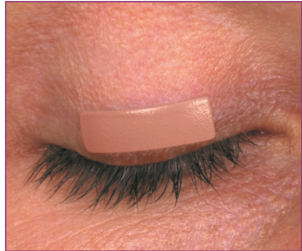
Blinkeze External Lid Weight

Blinkeze External Lid Weights are made of tantalum that is painted a skin tone on the exposed side to approximate a patient's complexion.